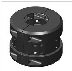
14099896 Gliding support made of painted aluminium for the installation on Ø 60 mm posts