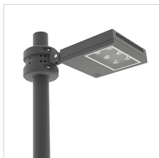
311043 Fixing bracket