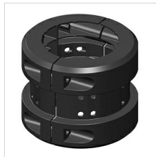
14099696 Gliding support made of painted aluminium for the installation on Ø 90 mm posts